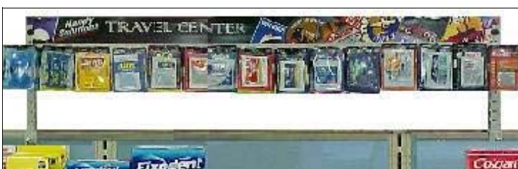
DD639 Gondola Topper Rack 4 ft. in length - clamps to top of counter, 2-Sided with 16 pegs on each side for an assortment of 32 different remedies!