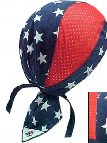
HE111 USA FLAG