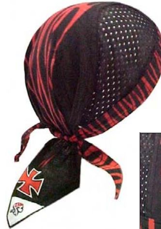
HE109 CROSS FLAME