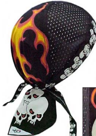
HE107 SKULL FLAME